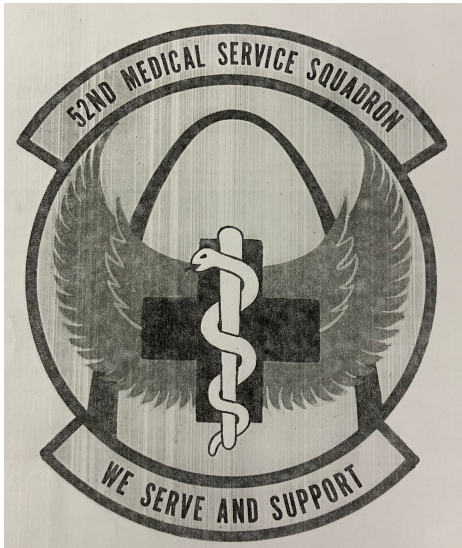
52 Medical Service Squadron emblem

52 Medical Service Squadron emblem: A disc divided white and blue by a yellow lightning bolt arched from the dexter top to sinister base, on the white a red cross couped charged with a vertical red entwined by a serpent all silver grey, on the blue three stylized gray wings all within a yellow border. Below a white scroll bordered yellow. SIGNIFICANCE: The emblem is symbolic of the squadron its mission. The blue field with the stylized flight symbols represents the sky, the primary theater of Air Force operations and the unit's aerospace medical mission. The lightning bolt depicts strength and speed with which the unit reacts in performing its primary mission. The field of white signifies the purity of medicine and the red Geneva Cross and staff of Aesculapius represents the medical profession. The emblem bears the Air Force colors ultramarine blue and gold yellow and national colors red, white, and blue.